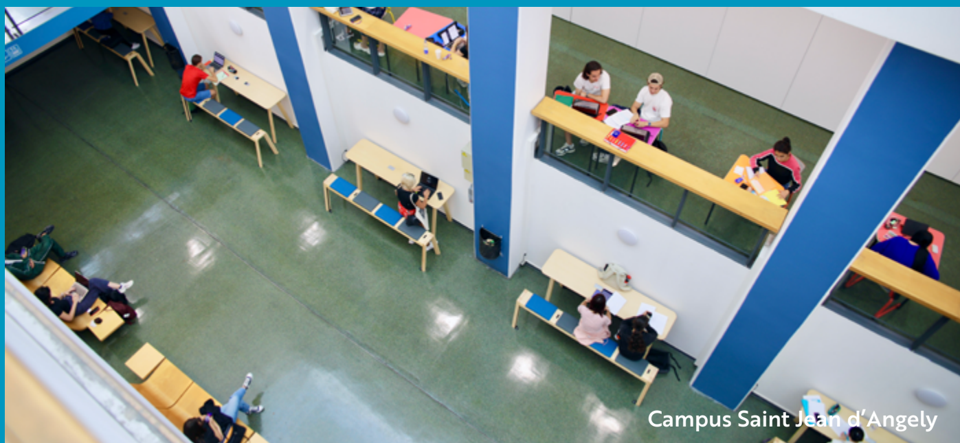
Campus Saint Jean d'Angely