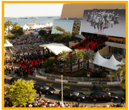
Day in Cannes