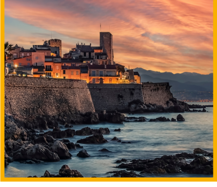
Day in Antibes