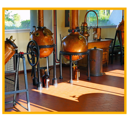
Visit of the Galimard Museum and fragrance creation workshop