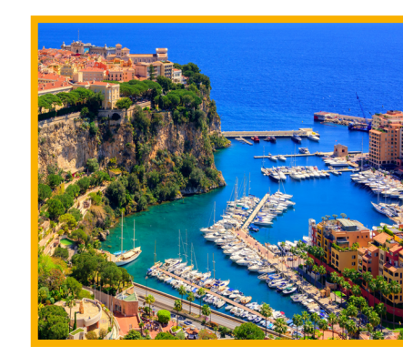
Day in Monaco