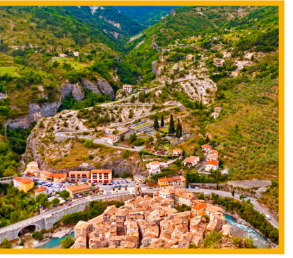
Pignes train excursion