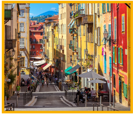
Visit of the old town