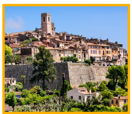
Day in Saint Paul de Vence